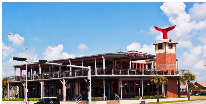
New meeting place: Fish Tales Restaurant