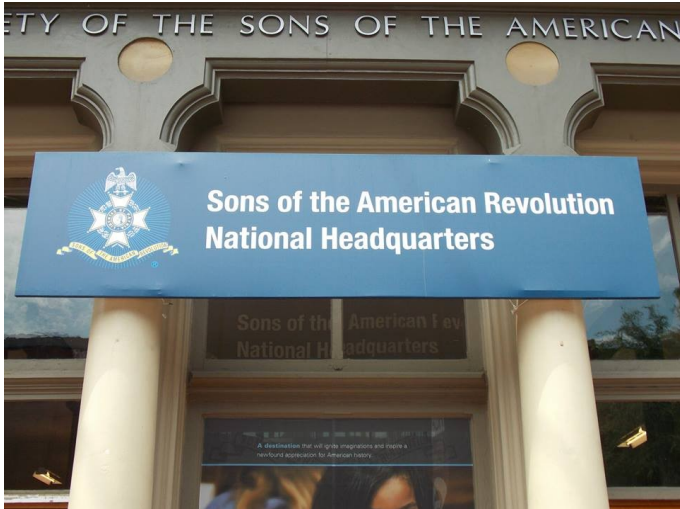
NSSAR Headquarters in Louisville, Kentucky