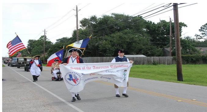
Bernardo de Galvez Chapter #1 leads the Seabrook Memorial Day Parade