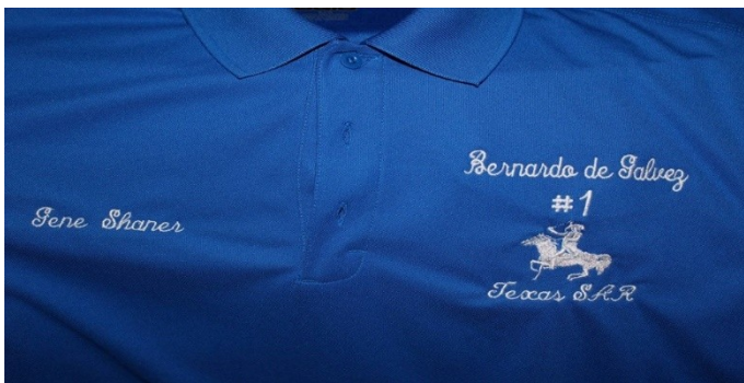
Bernardo de Galvez Chapter shirts, hats and Challenge Coins become available