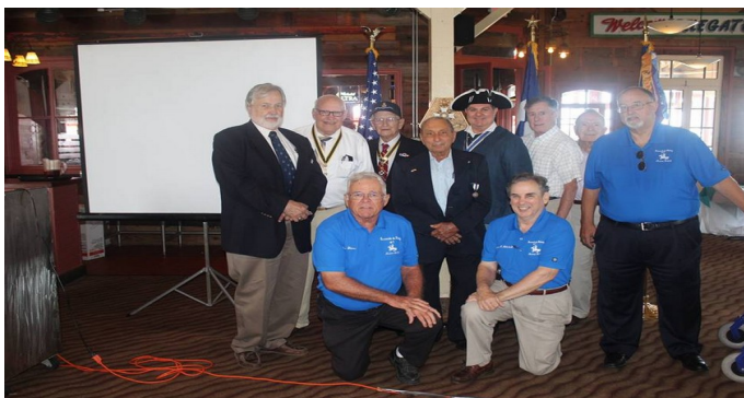
Members present at August 15th meeting