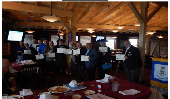
Certificates of Appreciation were awarded to members for their help during the recent Texas